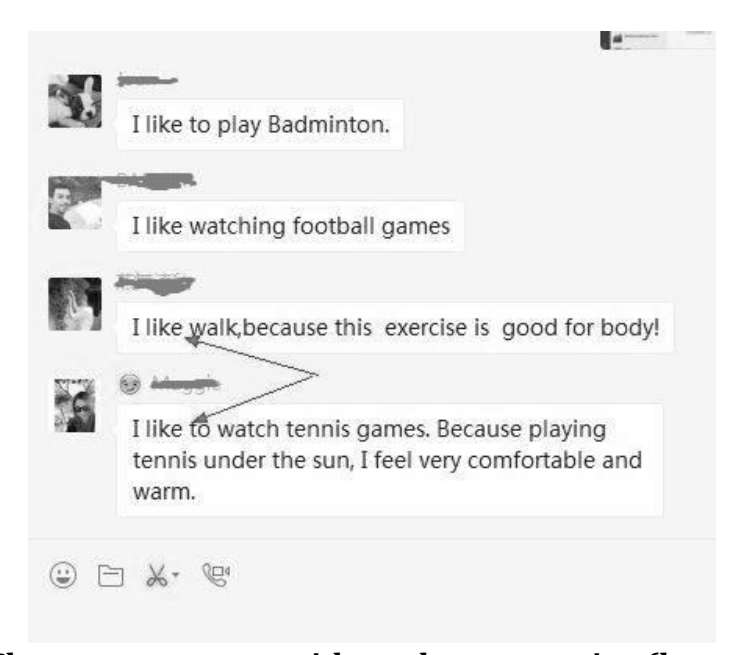
Figure 2. WeChat screen capture with teacher annotation (but not correction)

8. Encourage students to immediately ask questions, in or out of class, by text or by voice, about anything they have not understood, thereby creating an ongoing dialog with the teacher that enriches and personalizes the learning experience. Note that texting and voice-recording have the great advantage of being both immediate, taking advantage of the student's spike in interest or curiosity in the moment, and also repeatable after the fact in case of a student's time constraints, or the desire to understand better by repeated reading/hearing, etc. This has the advantages of both written and spoken corrections, but rolled into one seamless app.